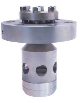
HSR high-security compressor valve restraints