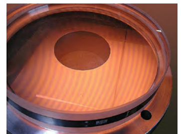
Optical comparator checks flatness of critical surfaces