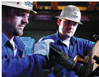
Comprehensive field services

Cook Compression is structured for responsiveness. Our technical representatives, field service teams, service centers and manufacturing facilities are strategically located and organized to react promptly and provide efficient, cost-effective service.