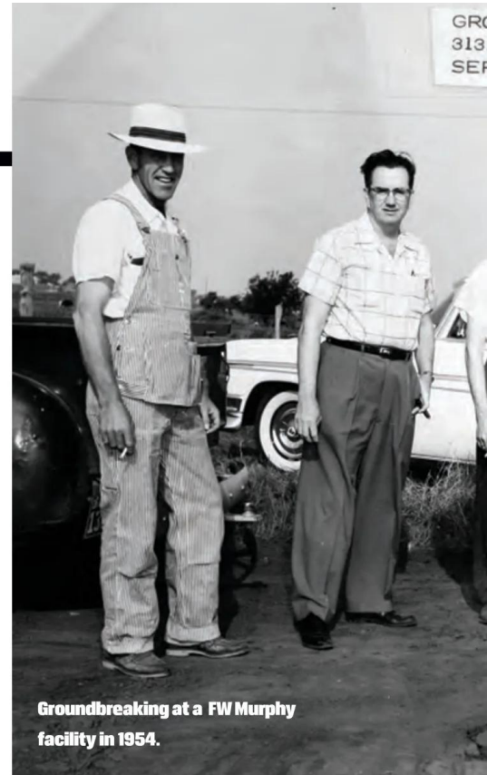
Groundbreaking at a FW Murphy facility in 1954.

by developing new materials and new components that can meet and exceed the requirements of hydrogen compressors.